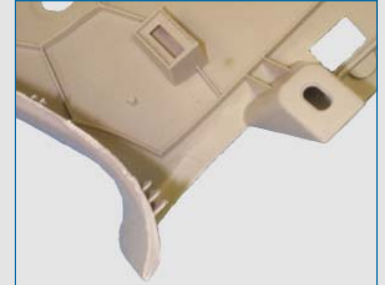
Cutting of plastic parts

Cutting and welding of a broad range of materials.