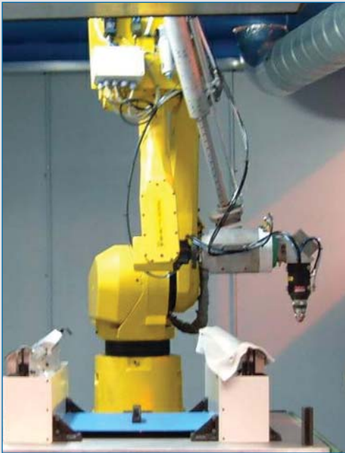
Articulated arm for CO2 laser