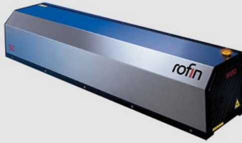
Rofin SC x30