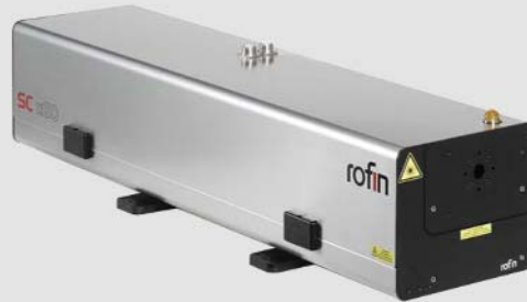
Rofin SC x60

The telescopic articulated arm has been designed by EINA as a basic component to deliver a CO2 laser beam in an industrial and reliable way down to the cutting head mounted on any kind of robot.